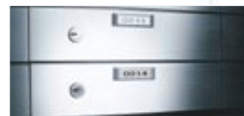
[New MAI Series]